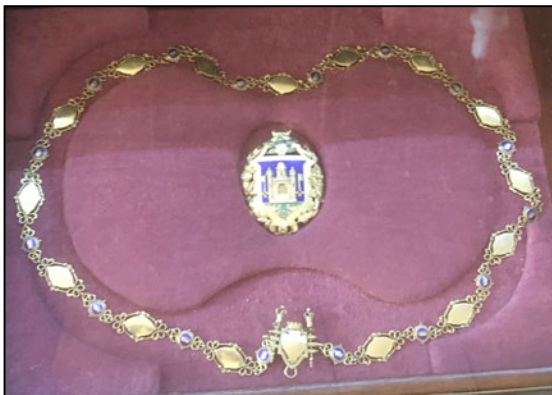
The Mayoress' Chain

A chain was provided for this by public subscription for the sum of £60-00.