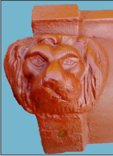
Red Oxide primed