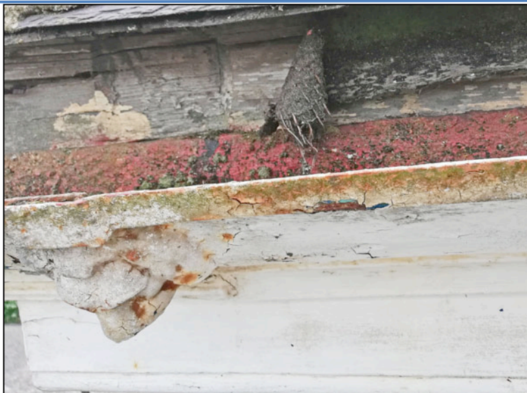
Before renovation started

top of the scaffolding. Making use of a handy knot called a pipe hitch, we lowered the lengths of guttering to the ground for a closer inspection. One of the gutters was broken which we thought might be a problem until we discovered that cast iron guttering is still readily available and not outrageously priced, though without the integral lion's head detailing. We spoke to our neighbours about what we were doing and to our delight discovered that they had kept some lengths of their old guttering which was still in their garden waiting to be rescued. The task in hand looked a little easier.