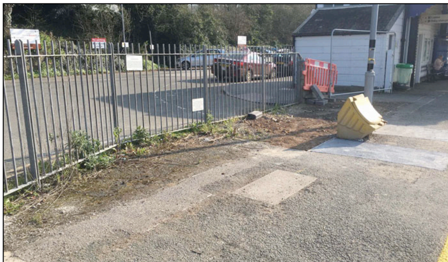
Proposed site of the new garden and pond on platform2

Network Rail have now removed the old footbridge and installed the new one (although the lifts are not yet in service). The plan to create a new garden and pond on platform 2, where the old footbridge steps were, is on hold until platform 1 is extended at the London end to take the new 9 coach trains.