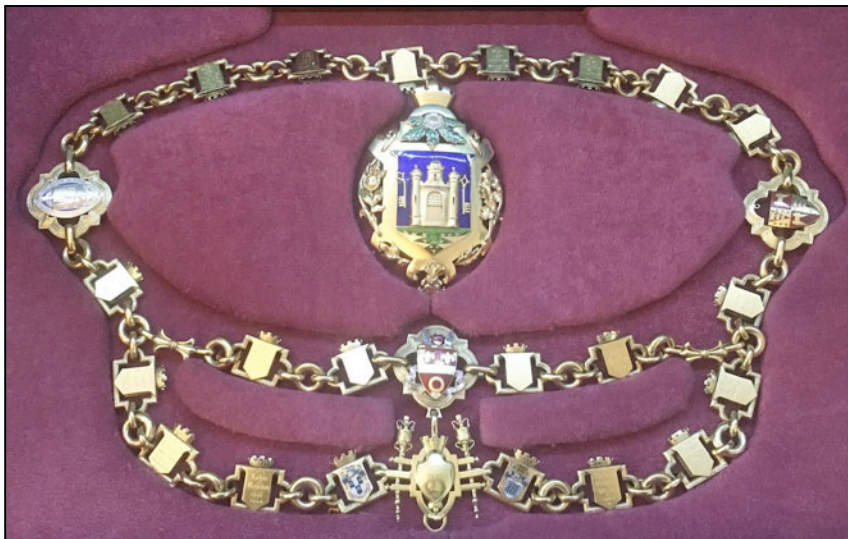
The Mayor's Chain and Badge of office

The chain now has 25 Shields including the arms of the 14th Duke of Somerset and the arms of the Windeatt, Kellock, Condry and Symons families.