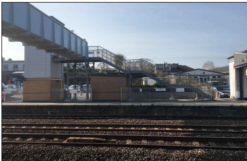
New footbridge and lift on platform 1