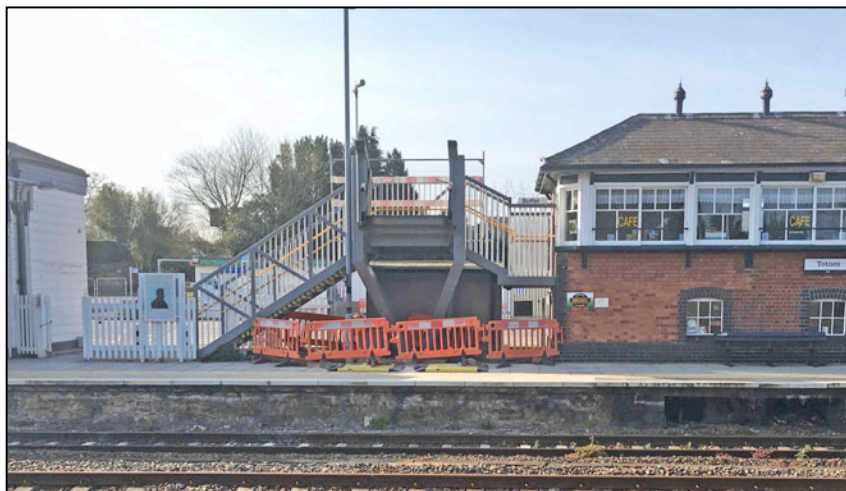
Remains of the old footbridge on platform 1